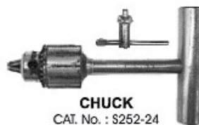
CHUCK CAT. No. : S252-24