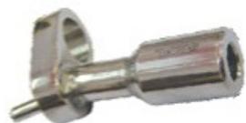
Cross Head Cat No. S255-10