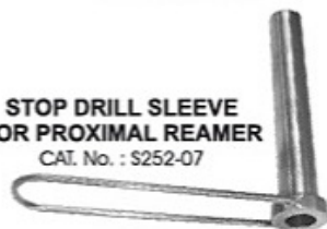
STOP DRILL SLEEVE FOR PROXIMAL REAMER CAT. No. : S252-07