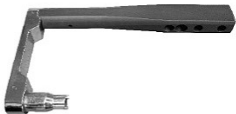
ALL. SIGHTING ZIG-PROXIMAL & DISTAL (SHORT NAIL) CAT. No. : S252-01 & 03