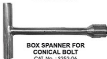
BOX SPANNER FOR CONICAL BOLT CAT. No. : S252-06